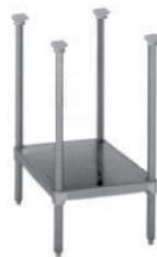
95-6060 S/S Stand