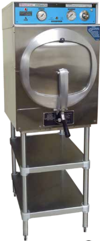
Shown on optional stand 95-6060